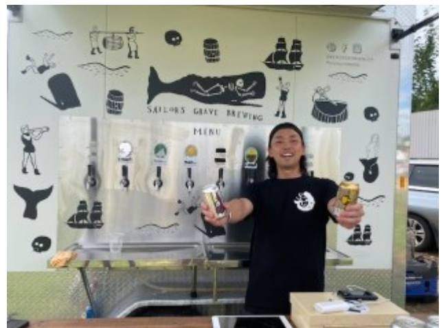
'Sailors Grave Brewing' van with beer on tap

The Garfield Community Association supported by the Cardinia Shire Council and the West Gippsland Progress Association organised the very successful event.