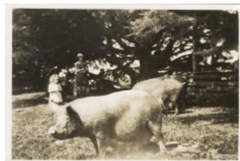
Pigs on the Rouse farm late 1930s