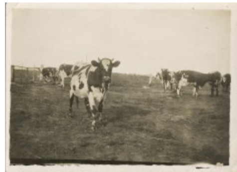
Fresian cows Rouse farm early 1950s