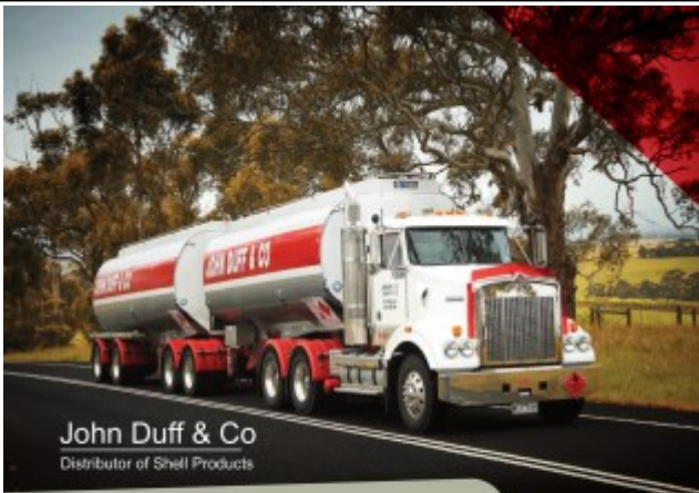
John Duff & Co Distributor of Shell Products

Give us call or find us on Facebook @WESTGIPPSLANDMINIDIGGERS and let us know how we can make your outdoor project come to life with an obligation free quote!