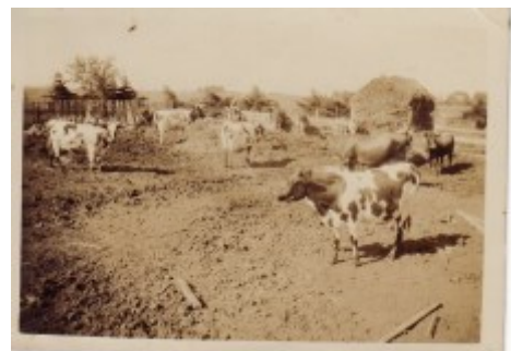
Rouse farm in 1928